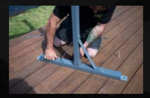
STEP 6: secure L-brackets per upright