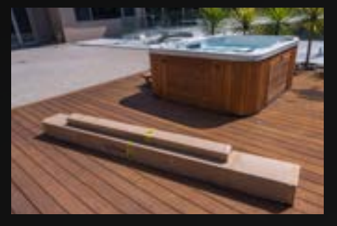
STEP 1: BOX1 = frame / legs / bolts BOX2 = awning / weather bag