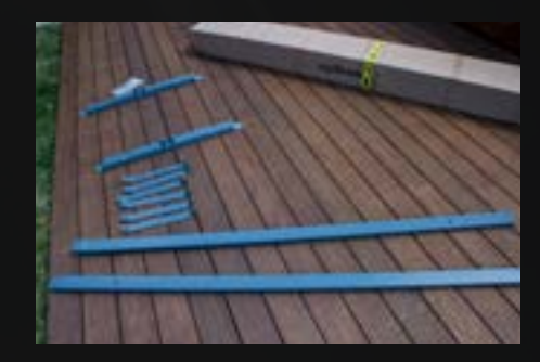
STEP 2: lay out frame 10 pieces