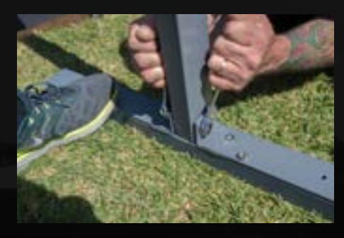
STEP 5: closer look at STEP4