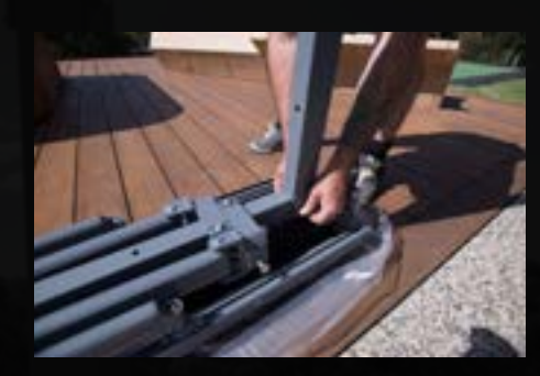
STEP 8: closer look at STEP7