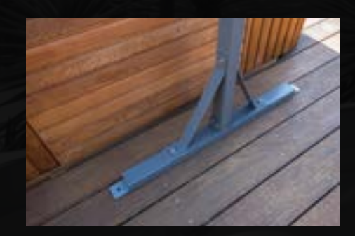
STEP 10: stand awning up & ensure square before fastening to ground/deck or dyna bolt (not supplied) into concrete