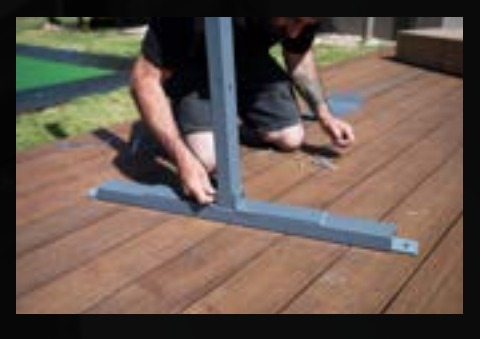
STEP 4: using 2 x bolts & washers, bolt each floor plate to the upright