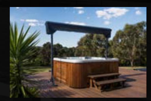
STEP 12: final product with easy care weather cover zipped