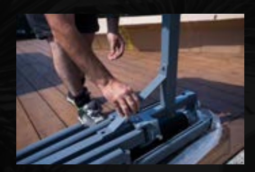
STEP 9: secure L-bracket for upright to awning x both sides