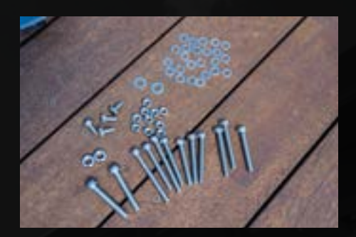
STEP 3: bolts laid out